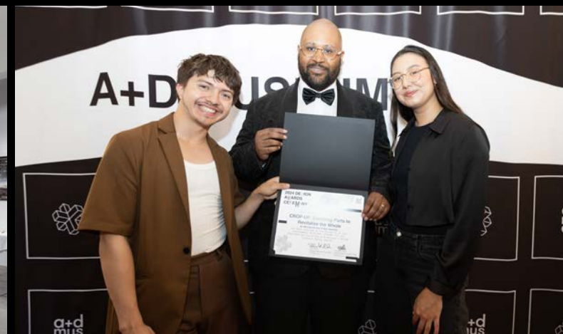
Architecture + Design Fundraiser Gala